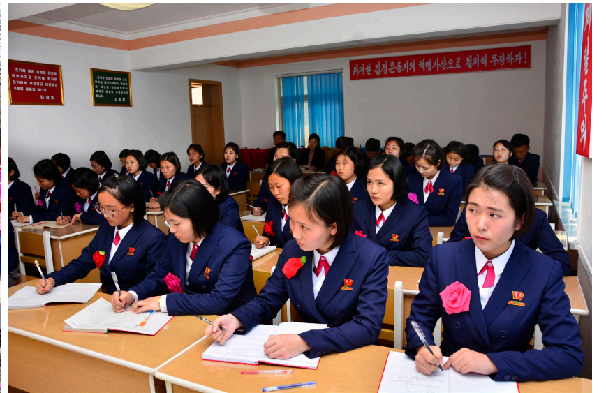
School-opening ceremonies are held at educational institutions across the country on April 1 to mark the new school year for 2025.