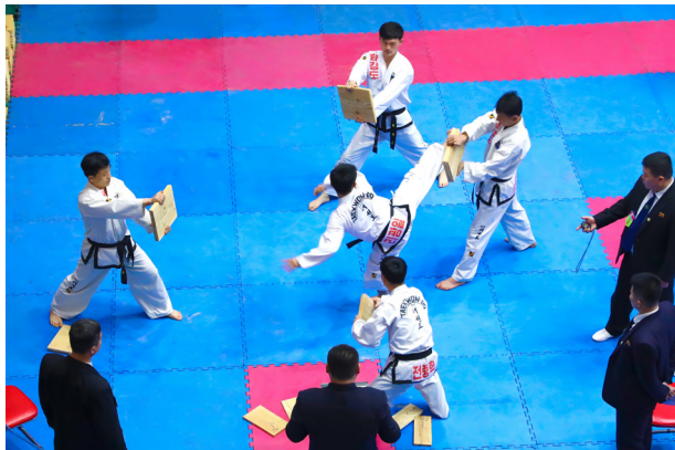
Scenes of impressive matches of the 14th National People's Games.