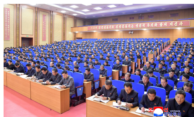
An enlarged plenary meeting of the Cabinet takes place on April 3.

The enlarged plenary meeting referred to the practical issues arising in providing a sure guarantee for the fulfilment of the five-year plan by carrying out the second quarterly national economic plan without delay by raising the enthusiasm for the all-people emulation for increased production and substantially stepping up the preparatory process for launching into the next stage development course and took appropriate measures.