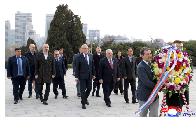
The delegation of the Communist Party of the Russian Federation lays a wreath at the Liberation Tower in Pyongyang on March 31.

A wreath in the name of the Central Committee of the Communist Party of