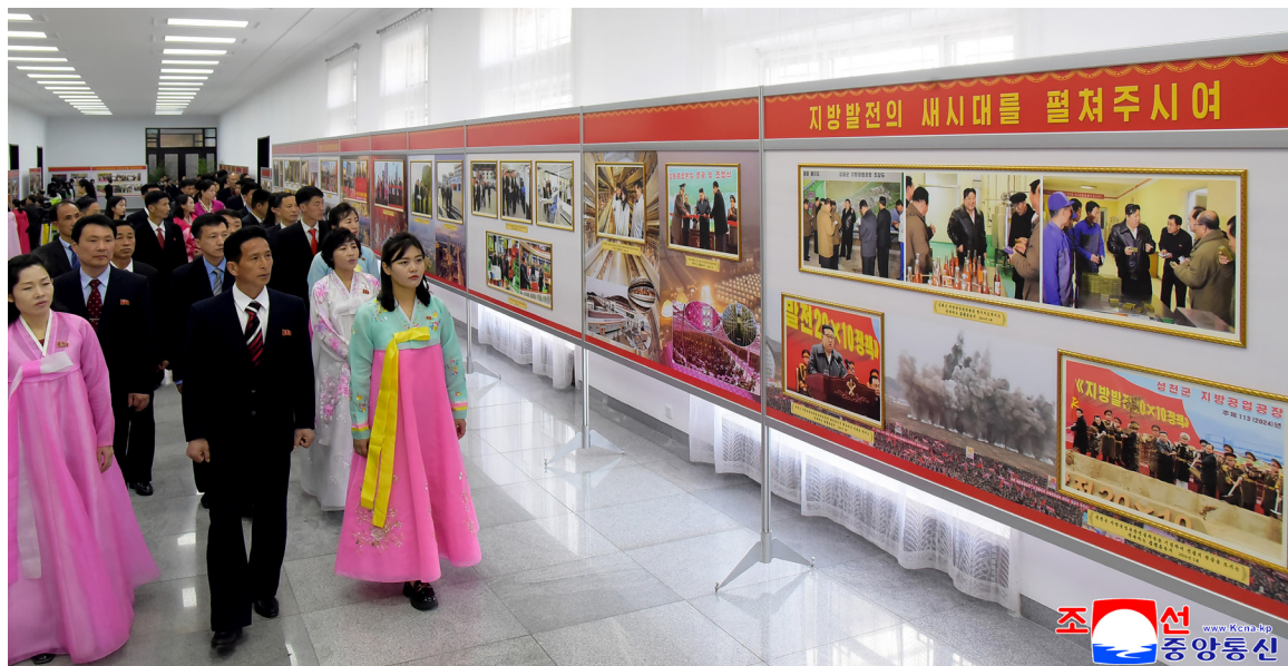
Visitors look round the photo exhibition which opened at the People's Palace of Culture in Pyongyang on April 3.