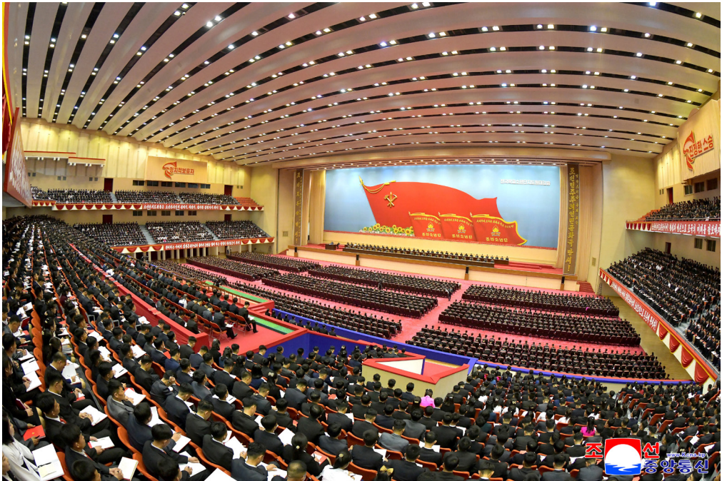
A grand short course of Korean Children's Union instructors from schools across the country is held in Pyongyang from March 26 to 29.

The grand short course heard speeches about experience.