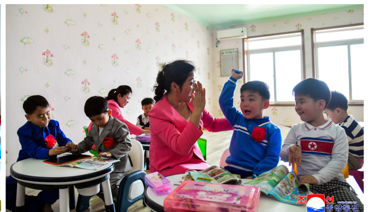
A ceremony takes place to start the new school year at the Korean Rehabilitation Centre for Children with Disabilities on April 1.