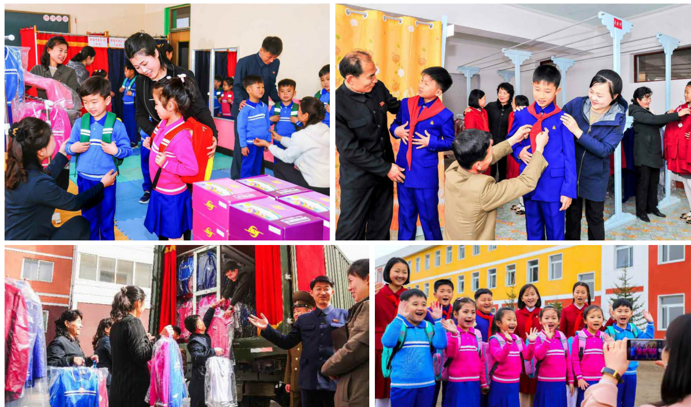
All new students throughout the country are supplied with school uniforms, shoes and bags ahead of the new school year.